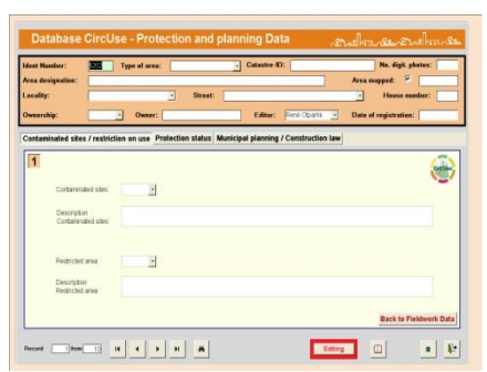
Figure 7: Screen Database – Protection and planning Data