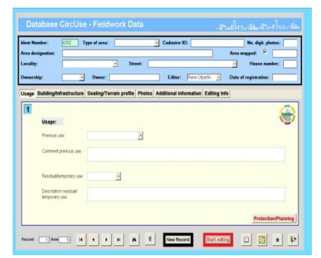
Figure 6: Screen of Database – Fieldwork Data