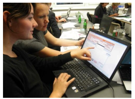
Figure 10: Czech project partners install the data land management tool

In the record tool the editor documents previously unknown sites which are recognised during the field work. To get an impression, photos are also useful and can be saved also in the system.