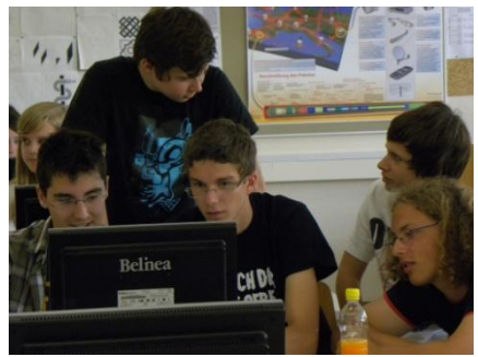
Figure 12: Team working together to complete tasks