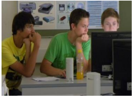
Figure 11: Student engage in the course program in Koeflach (Austria)