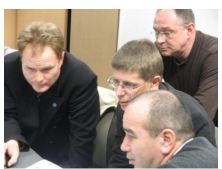
Figure 1: Installation of data land management tool

A data tool for land use management was developed in the CircUse project. Within the frame of a two day training and installation course all responsible project partner got knowledge regarding the installation, use and implementation of the new data land management tool.