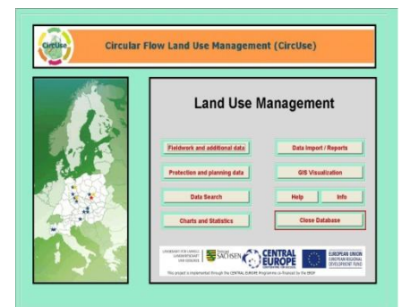
Figure 4: Starting screen of data land management tool