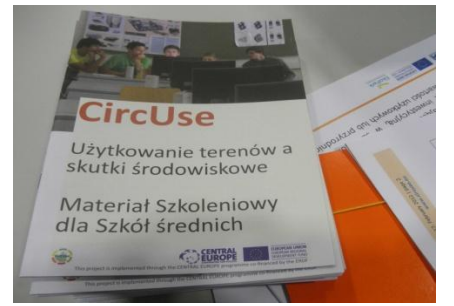
Figure 14: CircUse brochures on teaching materials for schools in six languages were produced